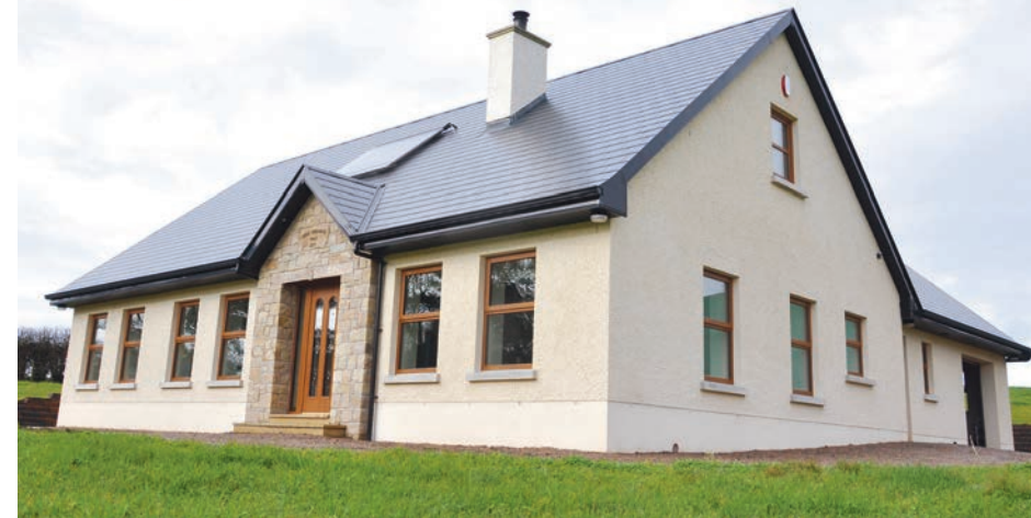
Northern Ireland's first Passive House - Cherry Tree House.

Another pleasing aspect of the project was the determination displayed not only by the staff at Moffitt and Robinson but also by the company's sub-contractors. "It was great to see just how determined our staff and sub-contractors were to promote the quality of their workmanship by being part of this project. We had a lot of challenges to meet but the determination displayed by the entire team was key to achieving Northern Ireland's first Certified Passive House." Air-tightness forms the centre-point of the project's success. The bungalow consists of a highly insulated, air-tight timber-frame fabric, with special attention given to critical areas