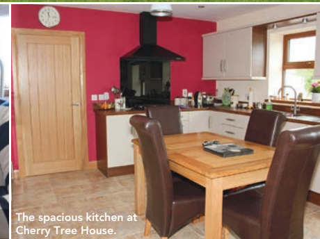
The spacious kitchen at Cherry Tree House.