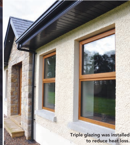
Triple glazing was installed to reduce heat loss.