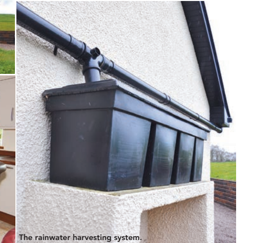
The rainwater harvesting system.