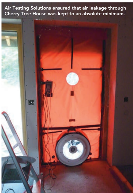
Air Testing Solutions ensured that air leakage through Cherry Tree House was kept to an absolute minimum.