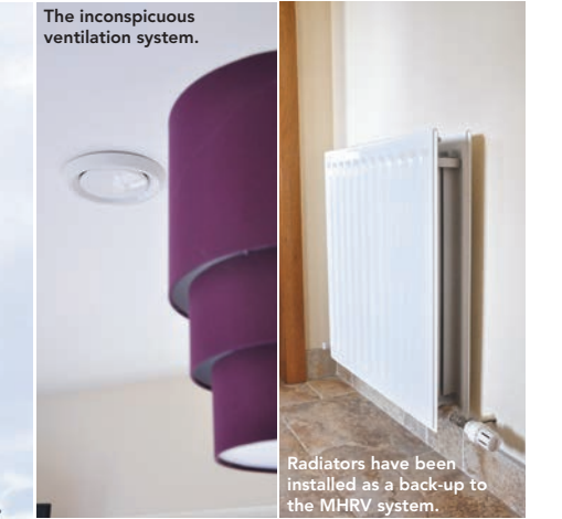
The inconspicuous ventilation system.